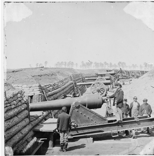
Battery of Parrott Guns Manned by Company C, 1st Connecticut Heavy Artillery - Fort Brady, VA, 1864